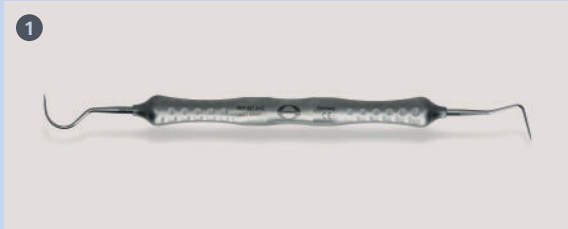
ERGOtouch duo Explorers (permanently fixed)