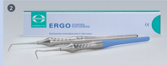
ERGOtouch Explorers, one-sided (permanently fixed)